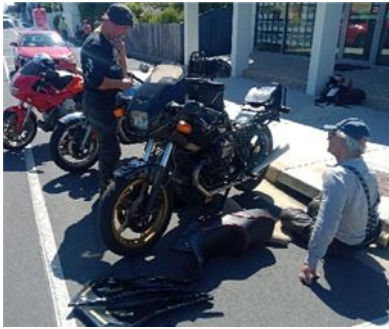
Mk V LeMans in Bicheno with foot brake lever spring broken-fixed with thin ocky strap for rest of trip 1100 Sport in background later developed drinking problem when fuel injection issue running very rich

And no trip would be complete without some tales of mechanical woe to test our mettle, but only 4 worth mentioning -