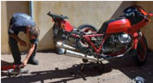
And the LMV on day 7 on way to Hobart noticed diff and right side of rear wheel coated in oil, so replacing the swing arm boot in Black Buffalo car park, Hobart.