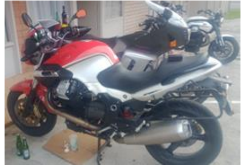
The 1200 S in St Helens with leaking sump after Gutter crossing